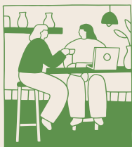
Free superfast broadband