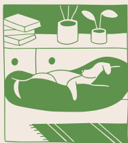
Pet friendly apartments