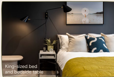
King-sized bed and bedside table