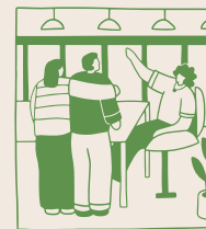
On-site and maintenance team