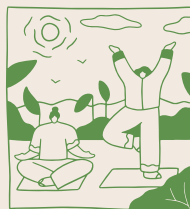
Flexible tenancies on your terms