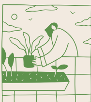
Three roof gardens & allotments