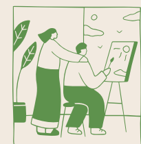
Regular resident events

Want to book a viewing or need to find out more? Contact our team today on +44 (0)1273 091 196.