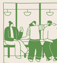
Lounge areas & work spaces