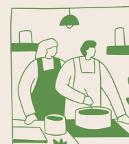
Private dining room