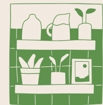
Freedom to decorate