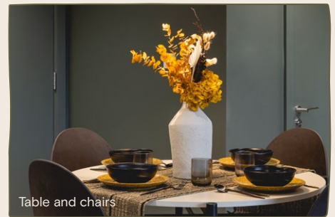
Table and chairs